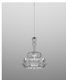
NOVEC SP M