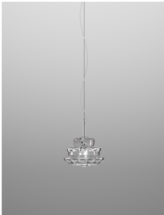
NOVEC SP P CRRI CR 14E CE