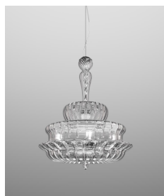
NOVEC SP G